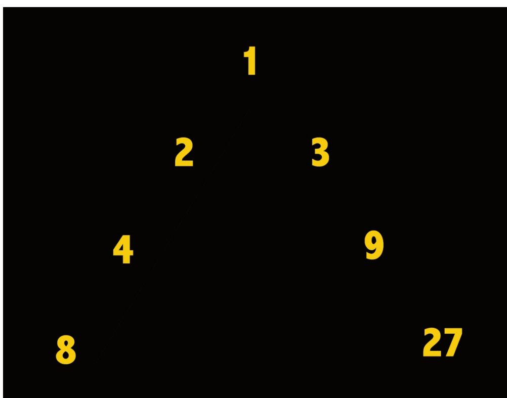
Plato's seven numbers were arranged by Crantor in the shape of the letter Lambda to emphasize the squares (4, 9) and cubes (8, 27) in Plato's planetary power proportions that Kepler would use to illustrate his Third Law of Planetary Motion in Harmonices Mundi .

These two cosmic constructs became associated with two Greek letters.