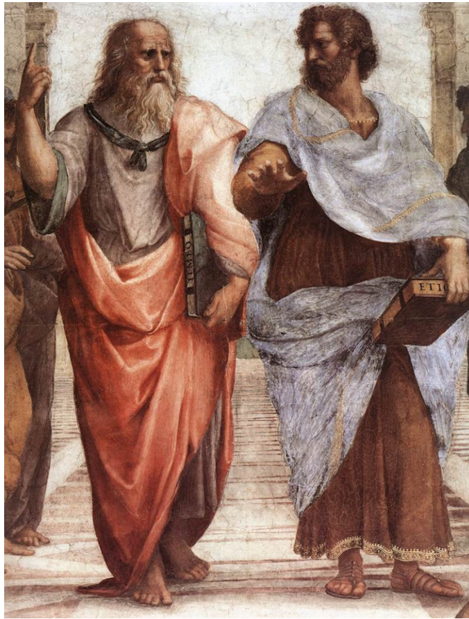
Plato holds Timaeus (left) in Raphael's fresco 'School of Athens' (Vatican, 1511)